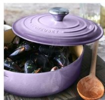
SUR LA TABLE LE CREUSET $284