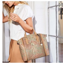
BRAHMIN DUXBURY STACHEL $335