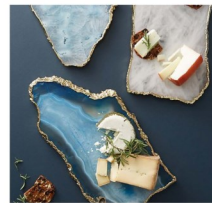
ANTHROPOLOGIE AGATE CHEESE BOARD $78