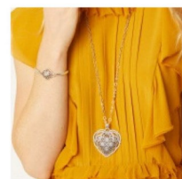
BRIGHTON BELLA ROMA NECKLACE $78