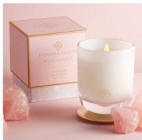
KENDRA SCOTT ROSE CANDLE $65